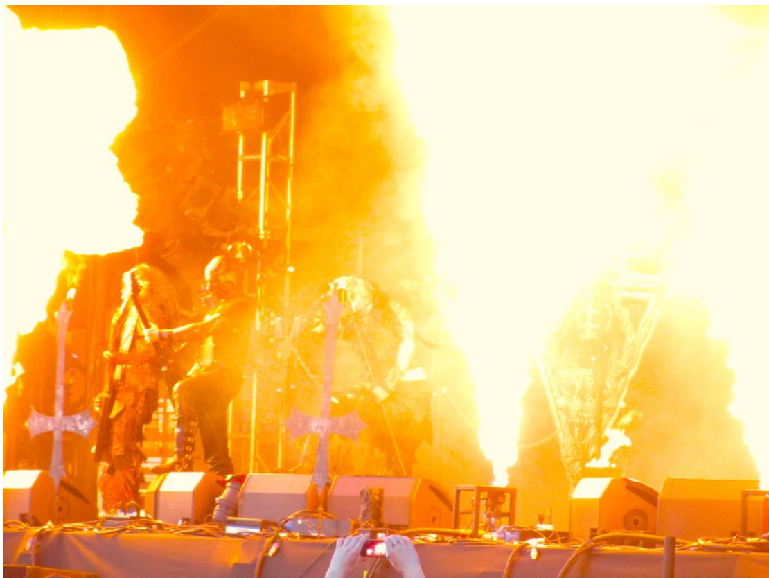
Image 4 Capturing a moment: More than just a spectacle? Watain, Bloodstock festival Catton hall, Derbyshire