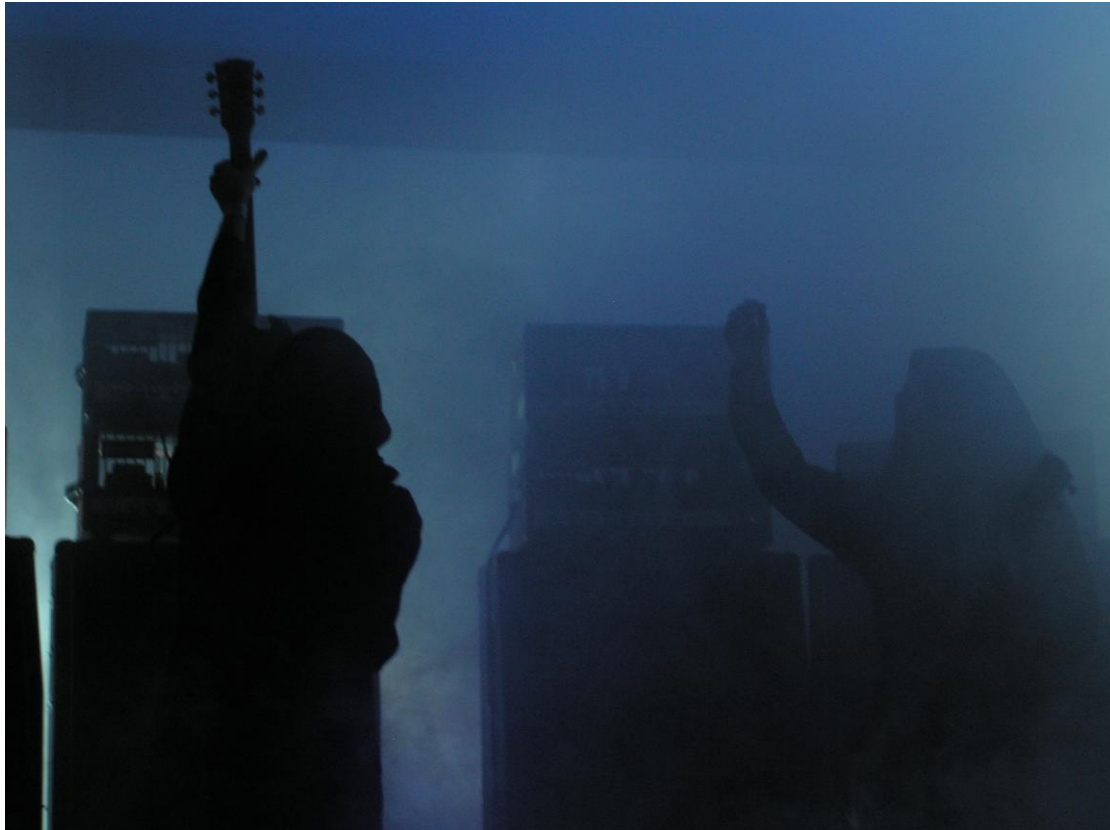
Image 5 SunnO))) Supersonic Festival, Birmingham 2009, image: © Niall Scott

to such a degree that some leave the performance space physically not able to deal with the noise.