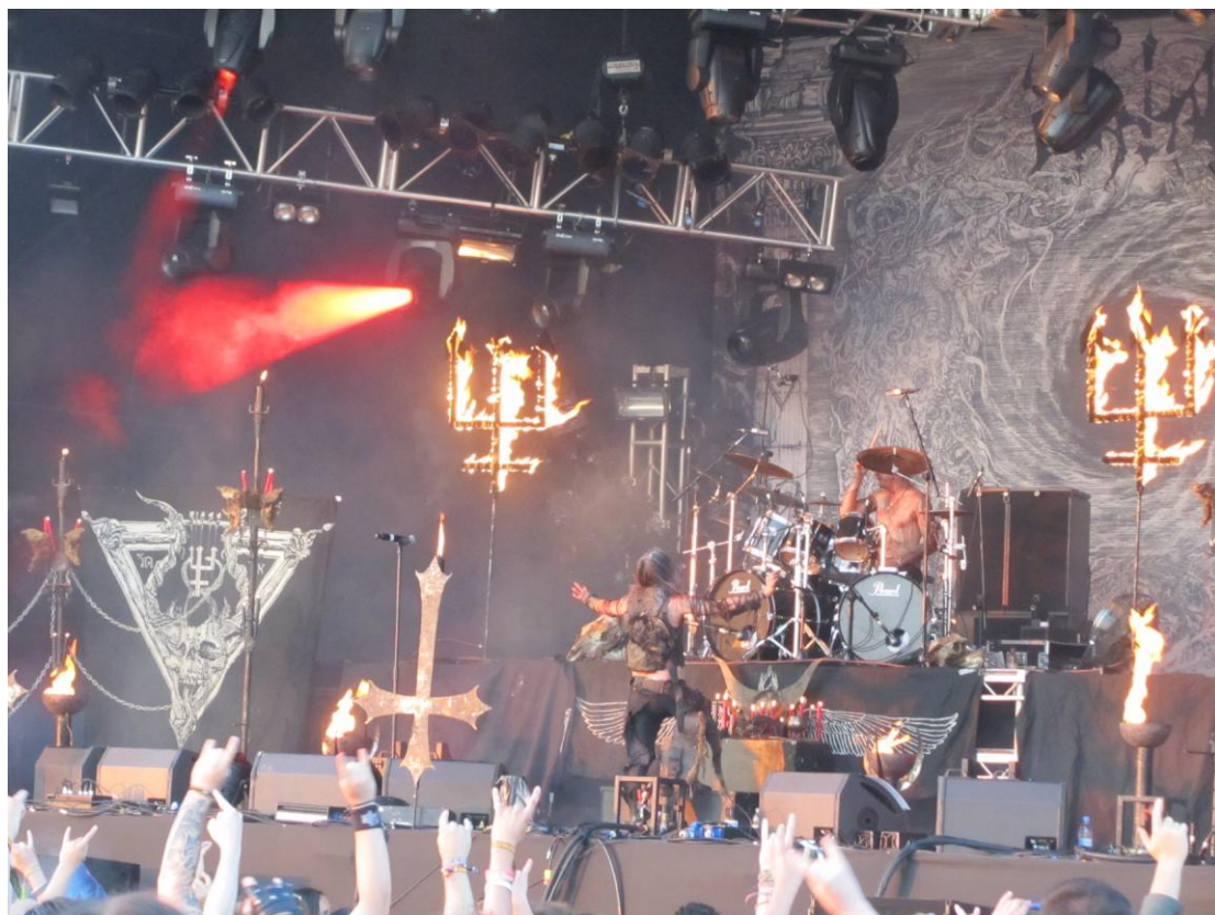
Image 3 Watain Bloodstock festival, 2012, Catton Hall, Derbyshire, image © Niall Scott

Once the music begins, for the most part there is no room for silence, but with continuous sound (as is also the case with drone metal) it is the recognition and memory of silence that allows one to make sense of the experience. One is confronted by a totality of noise, made comprehensible by a totality of silence. Words are putrefied to growls and slaughtered; as is the word of God: "For I am the one to bring the demise of the bearer of thorns" (Danielsson, 2000).