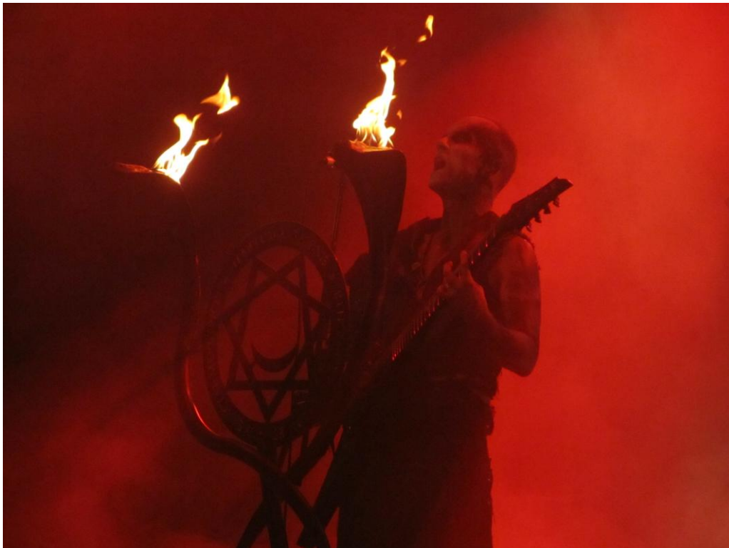
Image 1 Behemoth, Bloodstock festival, 2012, Catton Hall, Derbyshire