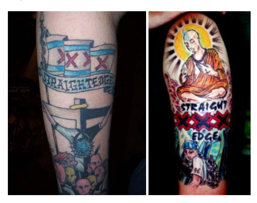
Fig 3. sXe tattoos demonstrating a mixture of apparently 'religious' and 'secular' imagery co-mingled to create one complete image and statement.

These two approaches are examples of how we can deconstruct without negating religion. Both are used, though not referred to explicitly in the following analysis of belief and faith within sXe.